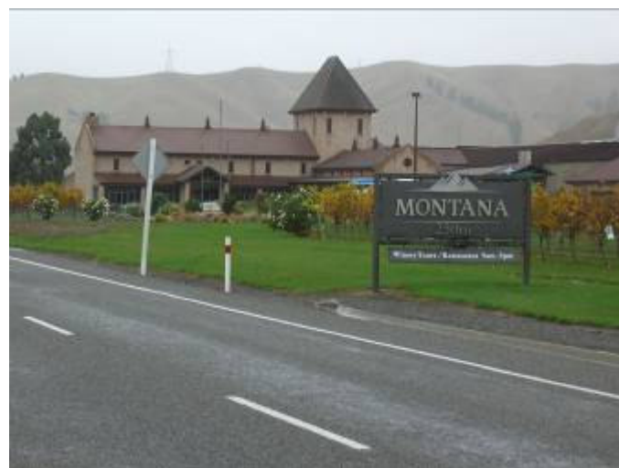
The Montana Winery