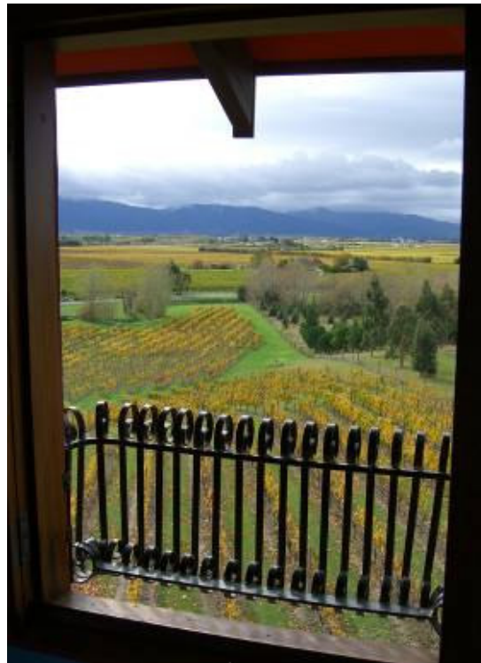
The Highfield Estate Winery - shades of Tuscany

All in all, a great place to educate your palette in fine white wines and enjoy some great scenery. I could tell you more but its best you find out for yourselves. With air travel to NZ being extremely good value at present it's a great time to travel.